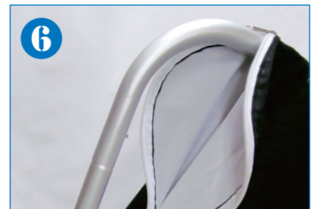
6. Once the frame is fully covered, zip the end of the graphic.