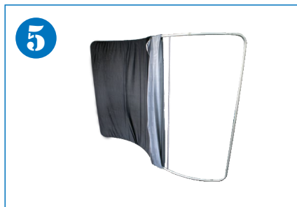
5. To install the graphic, slide the graphic on the frame from left to right until covered.