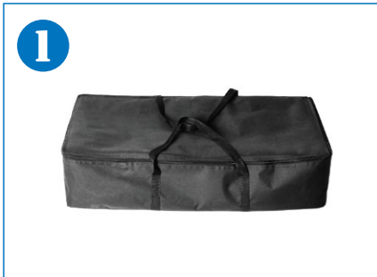
1. Black padded bag