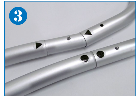
3. Assemble the frame by connecting the tubes with the same mark/shape