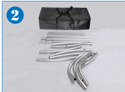
2. Take out the parts of the frame from the bag